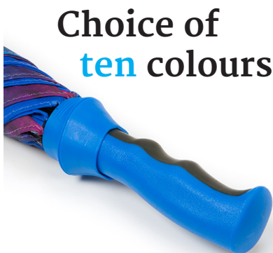
Standard plastic pistol grip handle with black finger grips

ProBrella FG Mini Double Canopy umbrellas are available with a black and navy pole only but with a choice of ten colours for handles and ferrules.